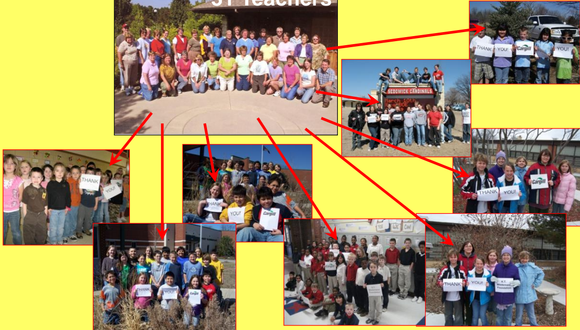
# of Students Reached by Kansas EPS