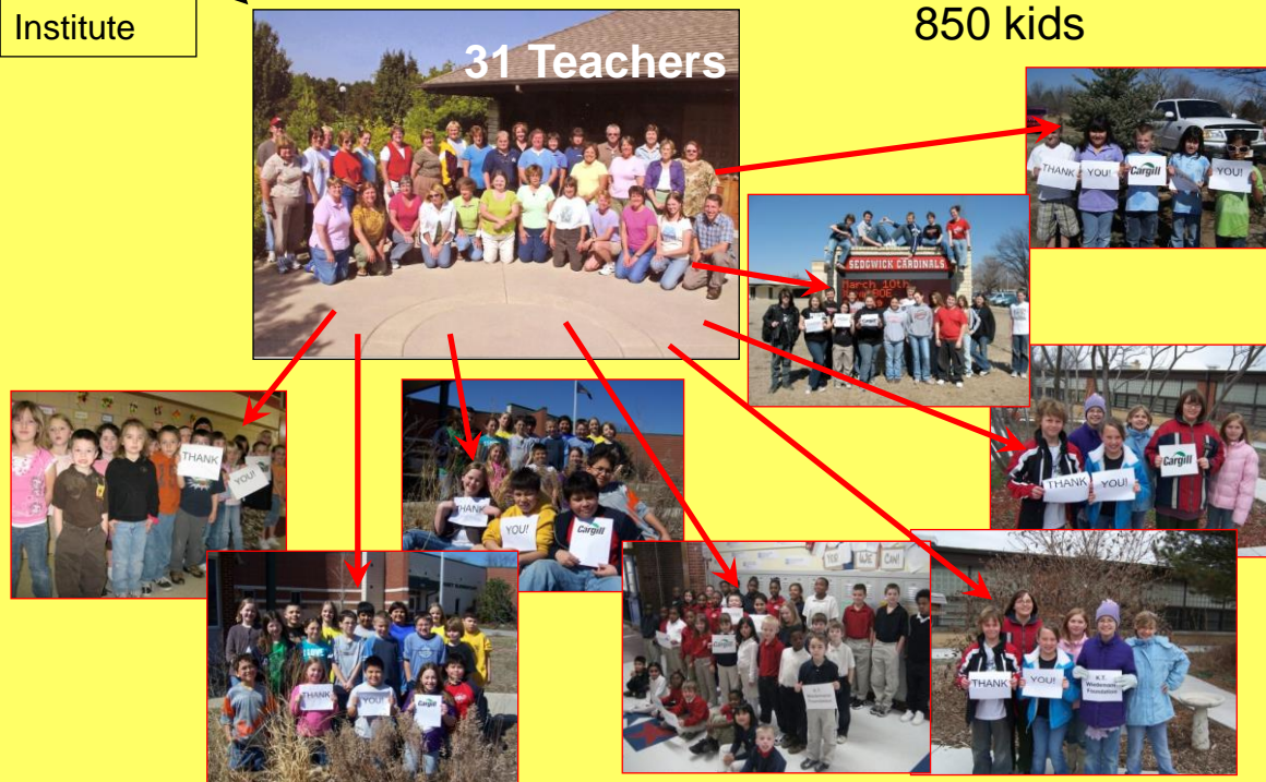
# of Students Reached by Kansas EPS