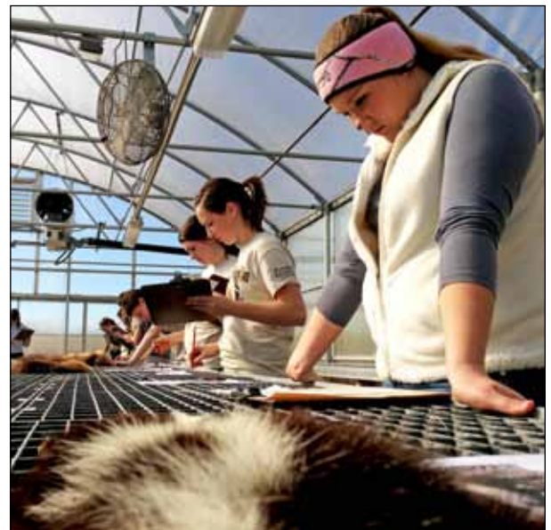
Left: Proctors from the Kansas Department of Wildlife Parks and Tourism work with students on the scavenger hunt portion of the Kansas State Eco-Meet in our Prairie Window Project at the 2013 competition. Right: Students complete the focus test on mammalogy in the greenhouse in 2013. This year the focus test on ornithology took place in the newly completed Prairie Discovery Lab.