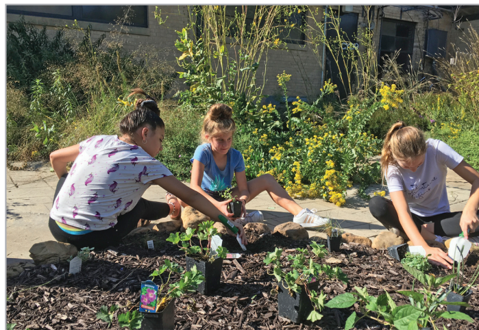
Peterson Elementary students plant a new prairie garden. An EPS garden planted a decade earlier blooms in the background.

To date, 257 teachers from 78 schools/entities trained during summer and winter EPS Institutes at the Dyck Arboretum are transformed by its unique curriculum. They regularly remark that this institute provides some of the most inspiring training