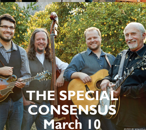
THE SPECIAL CONSENSUS March 10