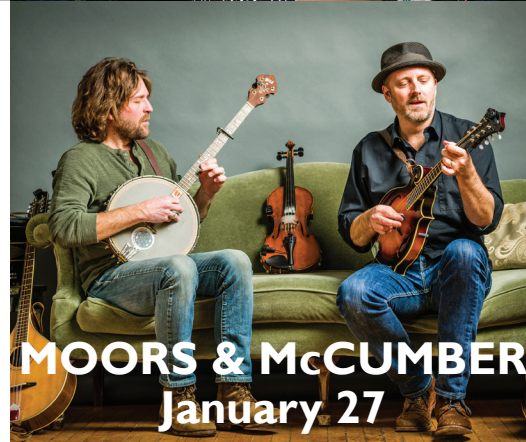
MOORS & McCUMBER January 27