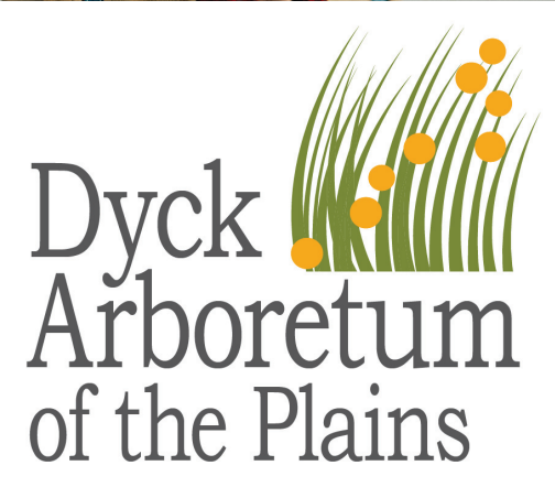
Dyck Arboretum of the Plains