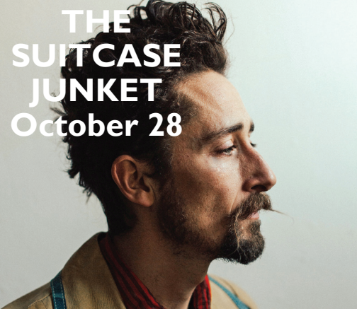
THE SUITCASE JUNKET October 28