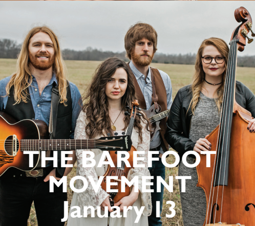
THE BAREFOOT MOVEMENT January 13