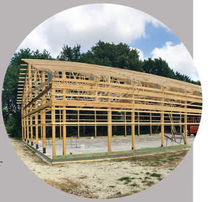
Photo right: Frame of the HUB as of July 2nd. Follow the progress of the HUB on Facebook or Instagram.

Please mark this box and return to the Arboretum with your gift, or donate online at dyckarboretum.org/giving-opportunities