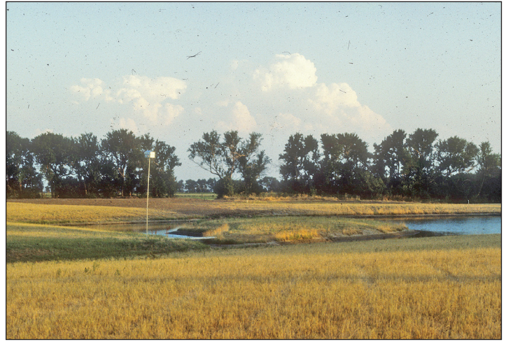
Dyck Arboretum pond as it appeared in 1984

For the 30th anniversary gathering, a bus will leave Wichita and arrive in Hesston in the morning, and be welcomed and have lunch at Hesston College. Following lunch, there will be a tour of the Dyck Arboretum grounds with arboretum staff and