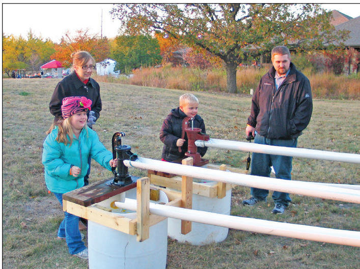
A Hesston family enjoys the duck races at last year's festival.