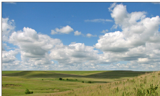
Prairie and sky at Tallgrass Prairie National Preserve

On Saturday, March 18, 2017 from 8:30 a.m. to 4:15 p.m., the Dyck Arboretum of the Plains will host its 11th annual spring educational symposium focused on living a Kansas land ethic. Collectively, "the land" in Kansas represents an immense array of natural resources for which we are very fortunate to be temporary stewards. Appreciating the value of these resources, educating ourselves about their complexities and vulnerabilities, learning how to be good caretakers, and making it a priority to pass them along in good shape to future generations should be important to all Kansans.