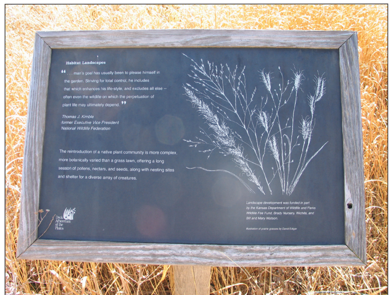
Dated signage in the arboretum will be getting an upgrade in 2015

Look for these improvements in 2015. We are excited about the new path and pending new signage. This prairie garden is here to serve you. If you have questions or comments about anything happening at the arboretum, please let us know.