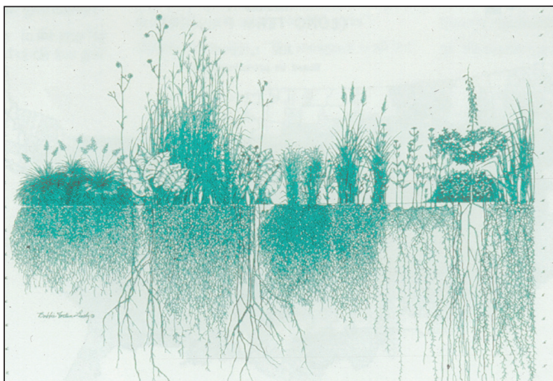
Once established, deep-rooted native plants survive without supplemental irrigation

Join Scott Vogt as he takes you through the process of planning, designing, installing and maintaining a native landscape. Come prepared with a scale drawing of your landscaping site. Attendees will receive an additional $5 discount at our 2015 spring plant sale to purchase the plants from their design. Cost is $20/person, $15/Members. Call the arboretum for reservations.