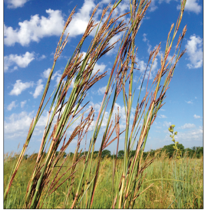
Many perennial species in the Prairie Window Project (including big bluestem, shown above) have now reached full maturity.

My son and the Prairie Window Project have each