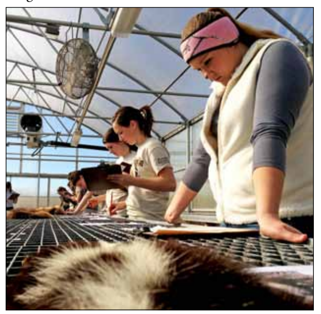
Left: Proctors from the Kansas Department of Wildlife Parks and Tourism work with students on the scavenger hunt portion of the Kansas State Eco-Meet in our Prairie Window Project at the 2013 competition. Right: Students complete the focus test on mammalogy in the greenhouse in 2013. This year the focus test on ornithology took place in the newly completed Prairie Discovery Lab.