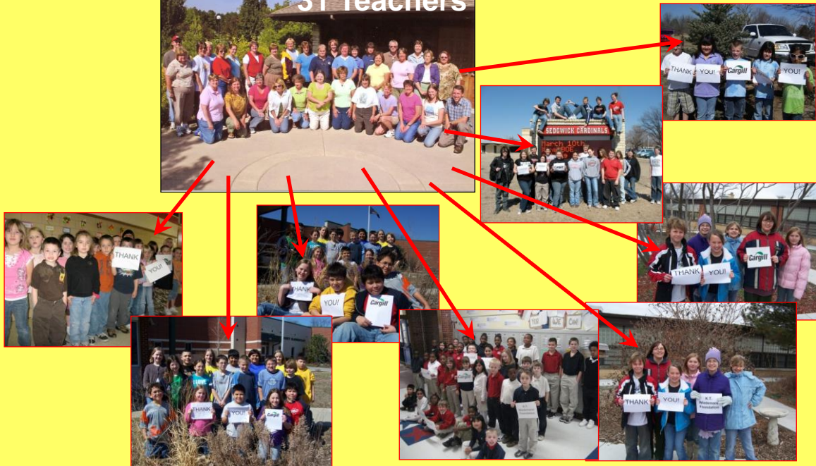
# of Students Reached by Kansas EPS