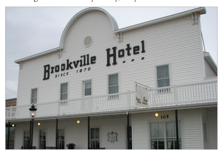
But first we'll enjoy a family-style fried chicken meal at the Brookville Hotel!!

Space for the trip is limited to the first 50 people. Our bus will leave the Arboretum at 8 a.m. and return around 6 p.m. $75 members/$85 for non-members will cover the entire trip including lunch. RSVP by Friday, May 18.