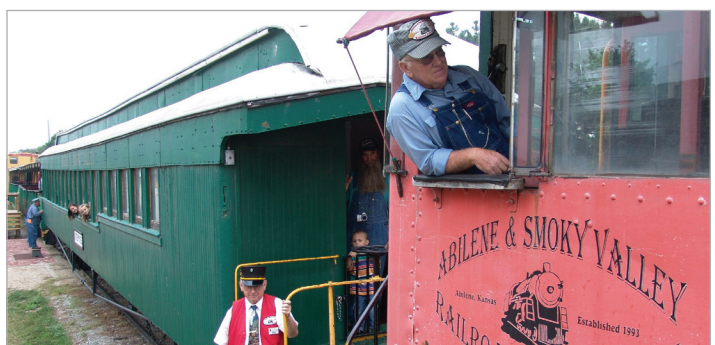
We'll ride the Abilene & Smoky Valley Railroad passenger train on May 31!

Following the tour, we will sit down to a family style meal at the Brookville Hotel. It is one of the best fried chicken dinners in Kansas. After lunch, we will have time at the Abilene Depot before our ride on the Abilene and Smoky Valley Railroad. The 2-hour ride on the rails of history will take us through ten