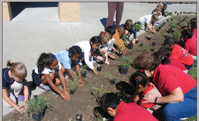
Students at Minneha Core Knowledge Magnet Elementary School planted this prairie pocket garden nearly 10 years ago when the Kansas Earth Partnership for Schools (EPS) program first began. Since that time, EPS participant teachers have been impacting thousands of students, using the hands-on, minds-on EPS curriculum to connect them with Kansas native plants.

On behalf of the board and staff, we thank you for your continued support!